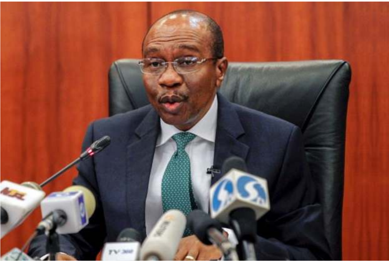
Governor, Central Bank of Nigeria, Mr. Godwin Emefiele addressing the press

he Governor of Central Bank of Nigeria (CBN), Mr. Godwin Emefiele, has said that with the continuous improvements in the nation's economy, closing the output gap brought about by COVID-19 slipping the economy into recession in 2020, Nigeria's Gross Domestic Product (GDP) is expected to rise between 2.5 percent and 3 percent by the end of 2021.